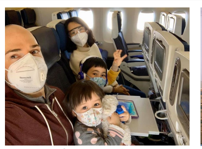
On our way from Asia to the U.S. in early February