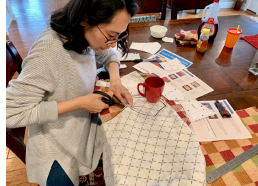
Coco getting started with face mask production

about setting up 'virtual visits' or live streaming events with your congregation or family. Please let us know if you are interested!