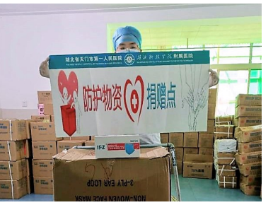
Medical workers in Hubei province receive donation of masks from CWEF