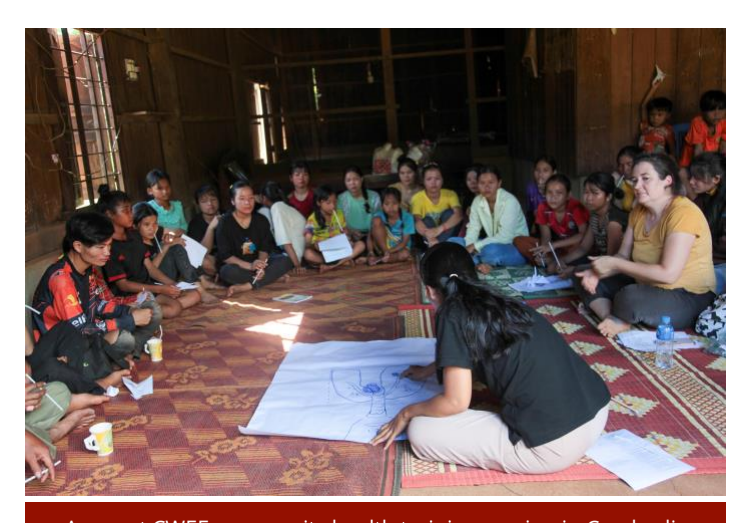
A recent CWEF community health training session in Cambodia