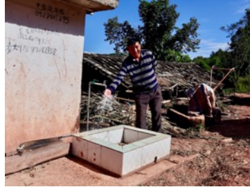
A happy customer at a new drinking water project site in rural Yunnan