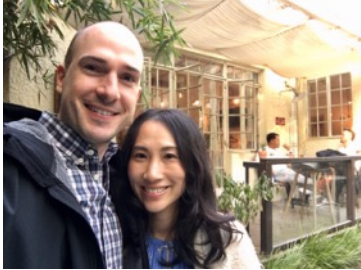
Celebrating our 5 th wedding anniversary