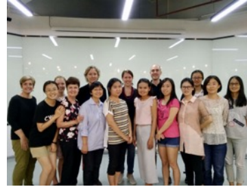
Our CWF team, all together at annual retreat