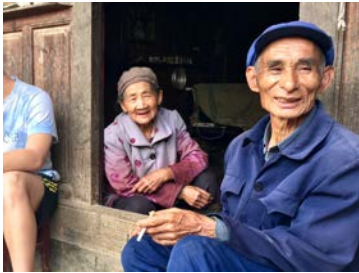
A lovely older couple we visited during a service trip in Yunnan