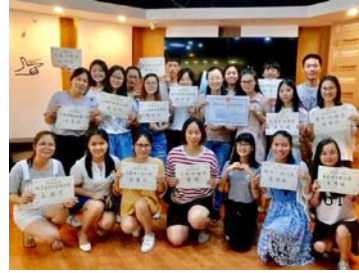
Founding members of Shining Star, nearly all previous CWF recipients