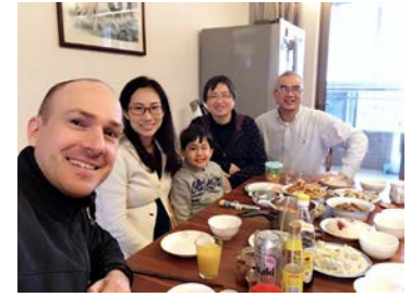
Celebrating Spring Festival (Lunar New Year) with our neighbors

In my role as director for CWEF, one of my main responsibilities is working to raise funds for CWEF's health and education programs in China and Cambodia. At the end of 2017, we ran a campaign called "81 by '18", aiming to raise enough to sponsor scholarships for 81 high school students in China before 2018. By God's grace and through the generosity of many people, we were able to surpass this goal and sponsor 139 young women!