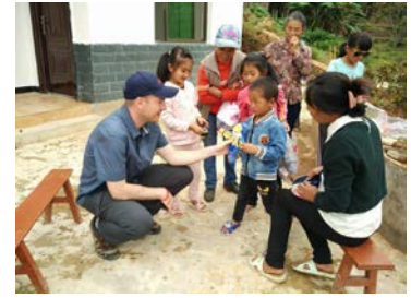
With kids in Yunnan during Concordia Int'l School Shanghai service trip

"Oh give thanks to the LORD; call upon his name; make known his deeds among the peoples! Sing to him, sing praises to him; tell of all his wondrous works! Glory in his holy name; let the hearts of those who seek the LORD rejoice! ...Let the heavens be glad, and let the earth rejoice, and let them say among the nations, 'The LORD reigns!'"